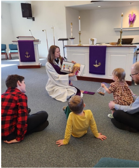
Children's Message on March 2, 2024